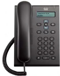
Cisco Unified SIP Phone 3900 Series