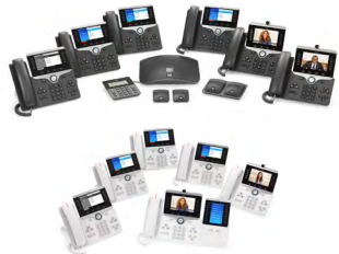
Cisco IP Phone 8800 Series in Charcoal and White

Next-Generation Video and Voice Communications