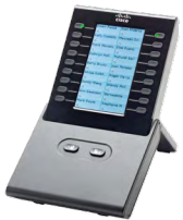
Cisco Unified IP Color Key Expansion Module

Professional SD Desktop Video Communications