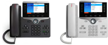
Cisco IP Phone 8841 in Charcoal and White

Next-Generation Video and Voice Communications