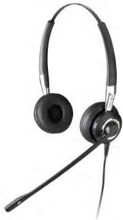
Jabra Biz 2400 Headset

Turn Traditional Telephones into IP Endpoints