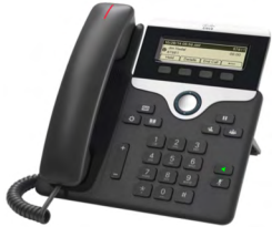
IP Phone 7811 in Charcoal