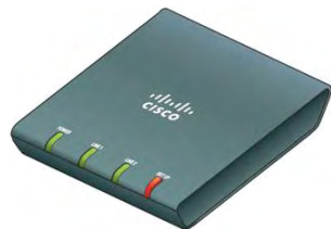
Cisco ATA 190 Analog Terminal Adaptor

Turn Traditional Telephones into IP Endpoints