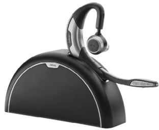
Jabra Motion UC Headset with Travel and Charge Kit

Turn Traditional Telephones into IP Endpoints