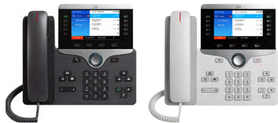
Cisco IP Phone 8861 in Charcoal and White

Next-Generation Video and Voice Communications