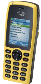
IP Phone 7925G-EX