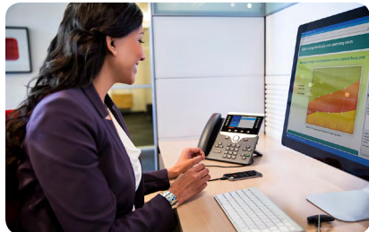
Cisco Intelligent Proximity for Mobile Voice and IP Phone 8861

Next-Generation Video and Voice Communications