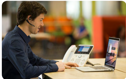
Cisco IP Phone 8851

Next-Generation Video and Voice Communications