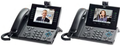
Figure 26. Interactive Video, High-Quality Communications, Affordable and Scalable