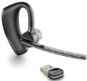
Figure 34. The Voyager Legend UC Is Almost a Personal Assistant

Turn Traditional Telephones into IP Endpoints