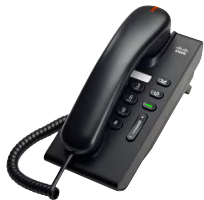
Cisco Unified IP Phone 6901