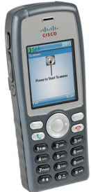
IP Phone 7926G

The Cisco Wireless IP Phone 7926G (Figure 12) builds upon the features of the 7925G. It includes the addition of a 2-dimensional (2D) EA11 bar-code scanner. Unlike a one-dimensional (1D) bar-code scanner, which typically uses a laser to read the bar code, the 2D scanner uses LEDs to illuminate the image and take a picture. The phone then decodes the image and presents the barcode information to the back-end systems application. The addition of the 2D scanner makes the Cisco Wireless IP Phone 7926G ideal for environments that require scanning capability and unified communications in a single, cost-effective device. This device consolidation increases productivity, reduces total cost of ownership (TCO), and enhances responsiveness in customer interactions.