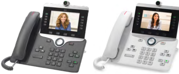
Cisco IP Phone 8845 in Charcoal and White

Next-Generation Video and Voice Communications