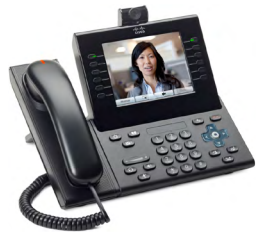
Cisco Unified IP Phone 9971

Professional SD Desktop Video Communications