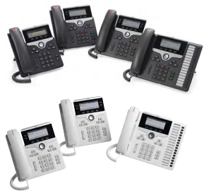
IP Phone 7800 Series