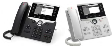
Cisco IP Phone 8811 in Charcoal and White

Next-Generation Video and Voice Communications