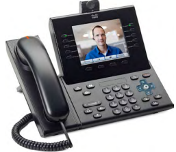
Cisco Unified IP Phone 9951

Professional SD Desktop Video Communications