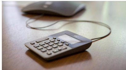
Cisco IP Conference Phone 8831

Next-Generation Video and Voice Communications