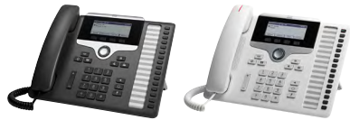
Cisco IP Phone 7861 in Charcoal and White