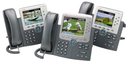
IP Phone 7945G, 7965G, and 7975G