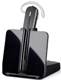
CS500 XD Series