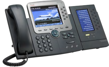
IP Phone Expansion Module 7916 with IP Phone 7975