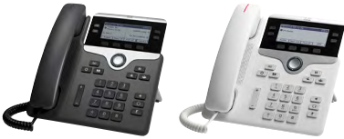
Cisco IP Phone 7841 in Charcoal and White