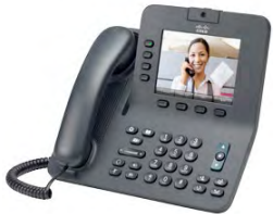
Cisco Unified IP Phone 8945