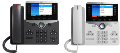
Cisco IP Phone 8851 in Charcoal and White

Next-Generation Video and Voice Communications