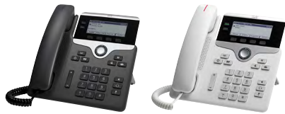
Cisco IP Phone 7821 in Charcoal and White