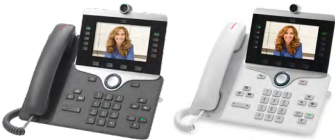
Cisco IP Phone 8865 in Charcoal and White