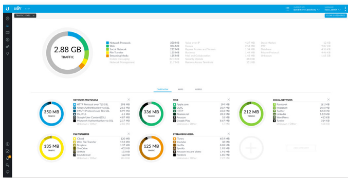
Statistics > Traffic Statistics screen of UniFi Controller

"With my mixer connected to a Wi-Fi network, I can control the sound anywhere in the facility from my iPad... You won't find anything but Ubiquiti at our facility from now on. There's no reason to try anything else; this stuff just works."