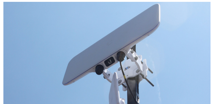
UniFi BaseStation XG mounted on a pole

Telos Online designed a large network using a mix of UniFi, airMAX, and EdgeMAX products. After deployment, Ubiquiti equipment delivered Wi-Fi coverage to over 50 acres of event space at Bandimere Speedway’s largest event, the Dodge Mile-High NHRA Nationals held during July 20-22, 2018.