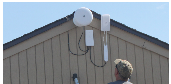
PrismStation 5AC and UniFi AC Mesh AP with antenna

Telos Online designed a large network using a mix of UniFi, airMAX, and EdgeMAX products. After deployment, Ubiquiti equipment delivered Wi-Fi coverage to over 50 acres of event space at Bandimere Speedway’s largest event, the Dodge Mile-High NHRA Nationals held during July 20-22, 2018.