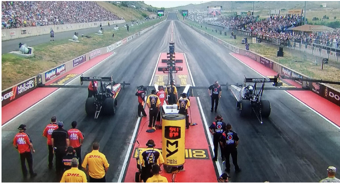
Starting line for the Top Fuel race

“No complaints from anyone, and the National Race Teams made extensive use of the system throughout and said it was one of the best systems they had ever used.”