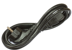
2x IEC cords