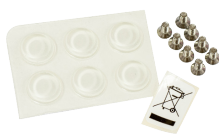
Screw and feet kit