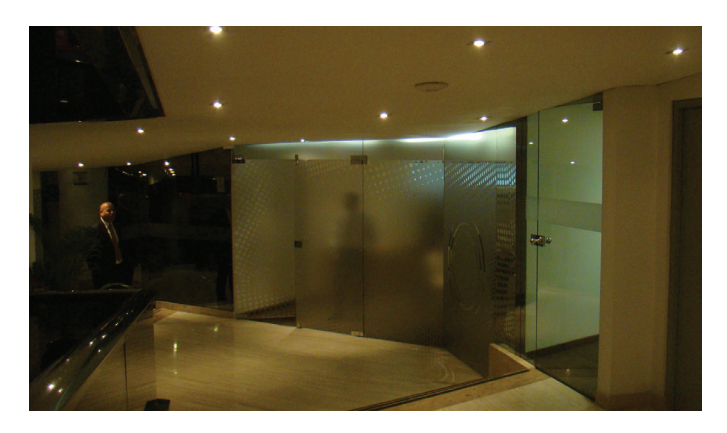
UniFi Access Point installed next to meeting rooms