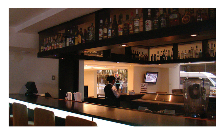
UniFi Access Point installed in hotel lounge