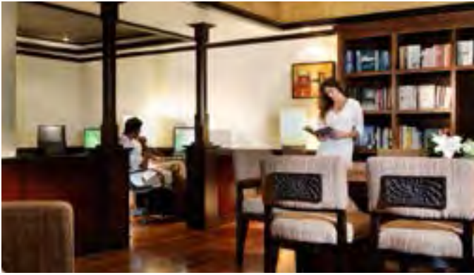
All areas, including the Inspiration Library, have Wi-Fi coverage