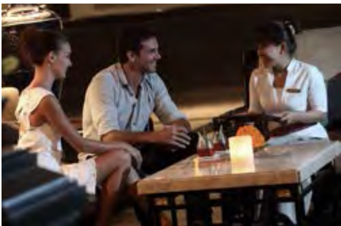
Wi-Fi allows the staff to engage guests anywhere in the hotel

FOR MODERN TRAVELERS, GOOD WI-FI IS ESSENTIAL