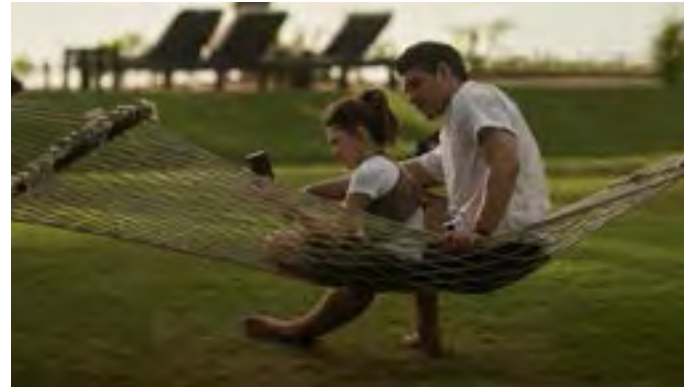
Guests have access to the Internet outdoors