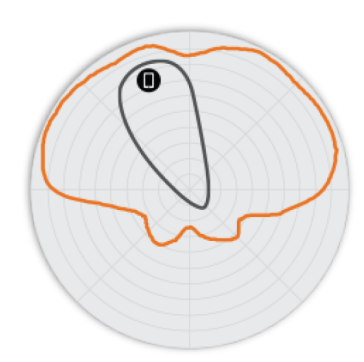
Figure 4. T750 2.4GHz Elevation Antenna Patterns