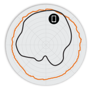
Figure 2. T750 2.4GHz Azimuth Antenna Patterns