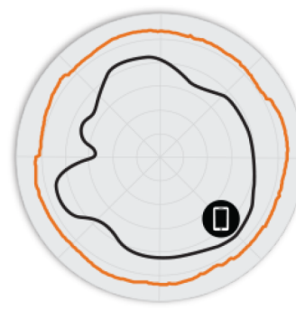
Figure 3. T750 5GHz AzimuthAntenna Patterns