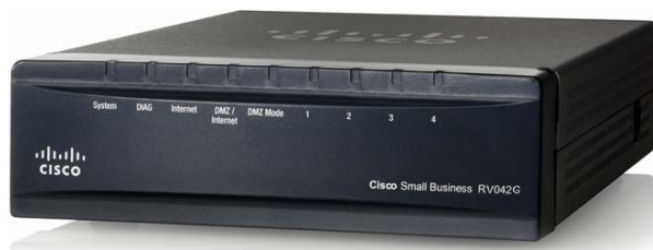
Figure 1. Cisco RV042G Dual Gigabit WAN VPN Router

To further safeguard your network and data, the Cisco RV042G includes business-class security features and optional cloud-based web filtering. Configuration is a snap, using an intuitive, browser-based device manager and setup wizards.