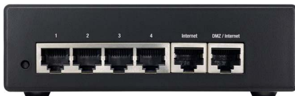
Figure 2. Back Panel of the Cisco RV042G

Figure 2 shows the back panel of the Cisco RV042G. Figure 3 shows a typical configuration.