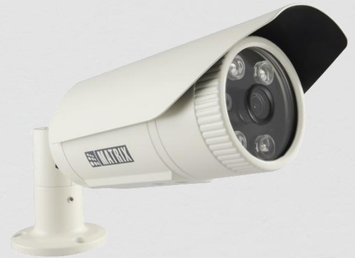
SATATYA CIBR50FL60CWS 5MP IR Bullet Camera with 6mm Lens

Matrix Project Series IP Cameras are built using superior components such as Sony STARVIS sensor and higher MTF lens to offer unmatched image quality especially during the low light conditions. Powered by True WDR algorithm, these cameras offer consistent image quality even in highly varying lighting conditions. Built in intelligent analytics including Intrusion Detection, Trip Wire, etc. ensure real-time security. Moreover, H.265 compression and Automatic Motion based Frame Rate Reduction save bandwidth and storage up to 50%.