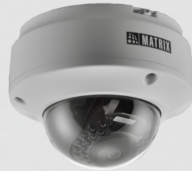
SATATYA CIDR20FL36CWS 2MP IR Dome Camera with 3.6mm Lens

Matrix Project Series IP Cameras are built using superior components such as Sony STARVIS sensor and higher MTF lens to offer unmatched image quality especially during the low light conditions. Powered by True WDR algorithm, these cameras offer consistent image quality even in highly varying lighting conditions. Built in intelligent analytics including Intrusion Detection, Trip Wire, etc. ensure real-time security. Moreover, H.265 compression and Automatic Motion based Frame Rate Reduction save bandwidth and storage up to 50%.