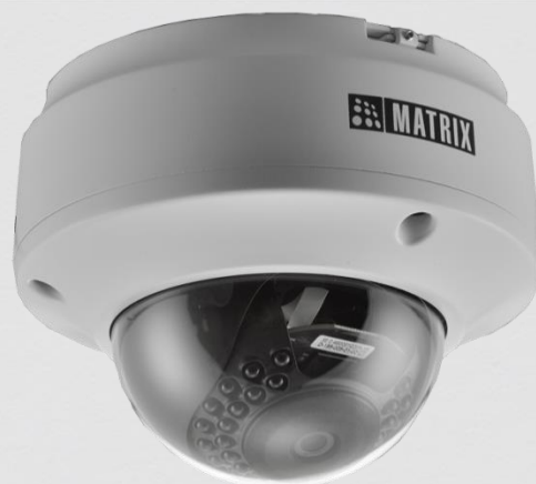
SATATYA CIDR20FL60CW-S 2MP IR Dome Camera with 6mm Lens

Matrix project series IP Cameras are built using superior components such as Sony STARVIS sensor and higher MTF lens to offer unmatched image quality especially during the low light conditions. Powered by True WDR algorithm, these cameras offer consistent image quality even in highly varying lighting conditions. Built in intelligent analytics including Intrusion Detection, Trip Wire, etc. ensure real-time security. Moreover, H.265 compression and Automatic Motion based Frame Rate Reduction save bandwidth and storage up to 50%.