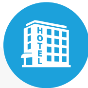
Hotels & Enterprises